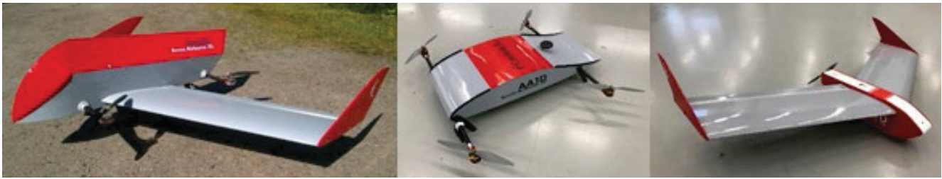
Fig. 3. Logistic UAV prototypes from left to right: Type-1 is VTOL UAV, type-2 is lift body UAV and type-3 is fixed wing UAV

working properly and can carry the load which it has been designed for.