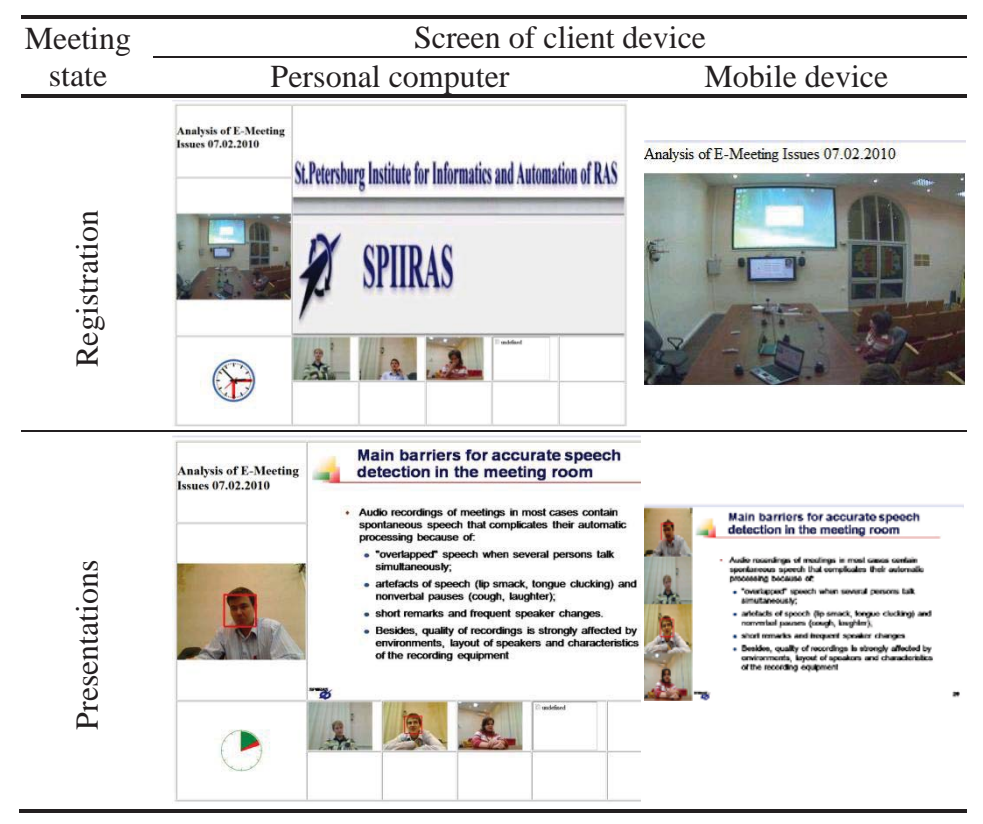
Table 2. Content examples of the web-based application for meeting.

Logical-temporal model of compilation of web-page graphical interface was tested on a personal computer and several models of smartphones donated by the Nokia company. Table 3 presents some examples of web-page content during a meeting. The sound source localization system and multichannel speech activity detection system were used for selection of source of audio stream transmitted to remote participant. Speech of a presenter is recorded by the microphone of the web-camera closest to the presentation area. The built-in microphone of the web-camera assigned with the presently active participant sitting at the conference table is used for recording his/her speech.